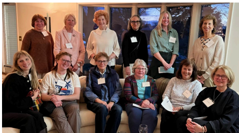
New members at orientation.