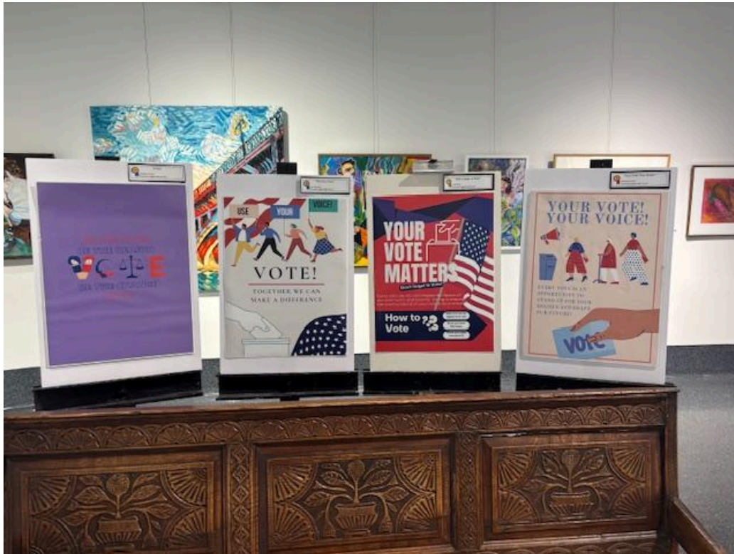
Winning Posters on display at Grosse Pointe War Memorial