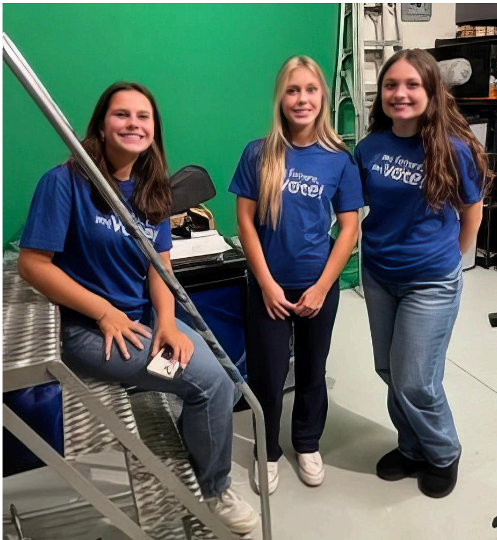
Three of the Grosse Pointe South students who appeared in the videos.