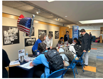
League volunteers assist University Liggett students at the registration table